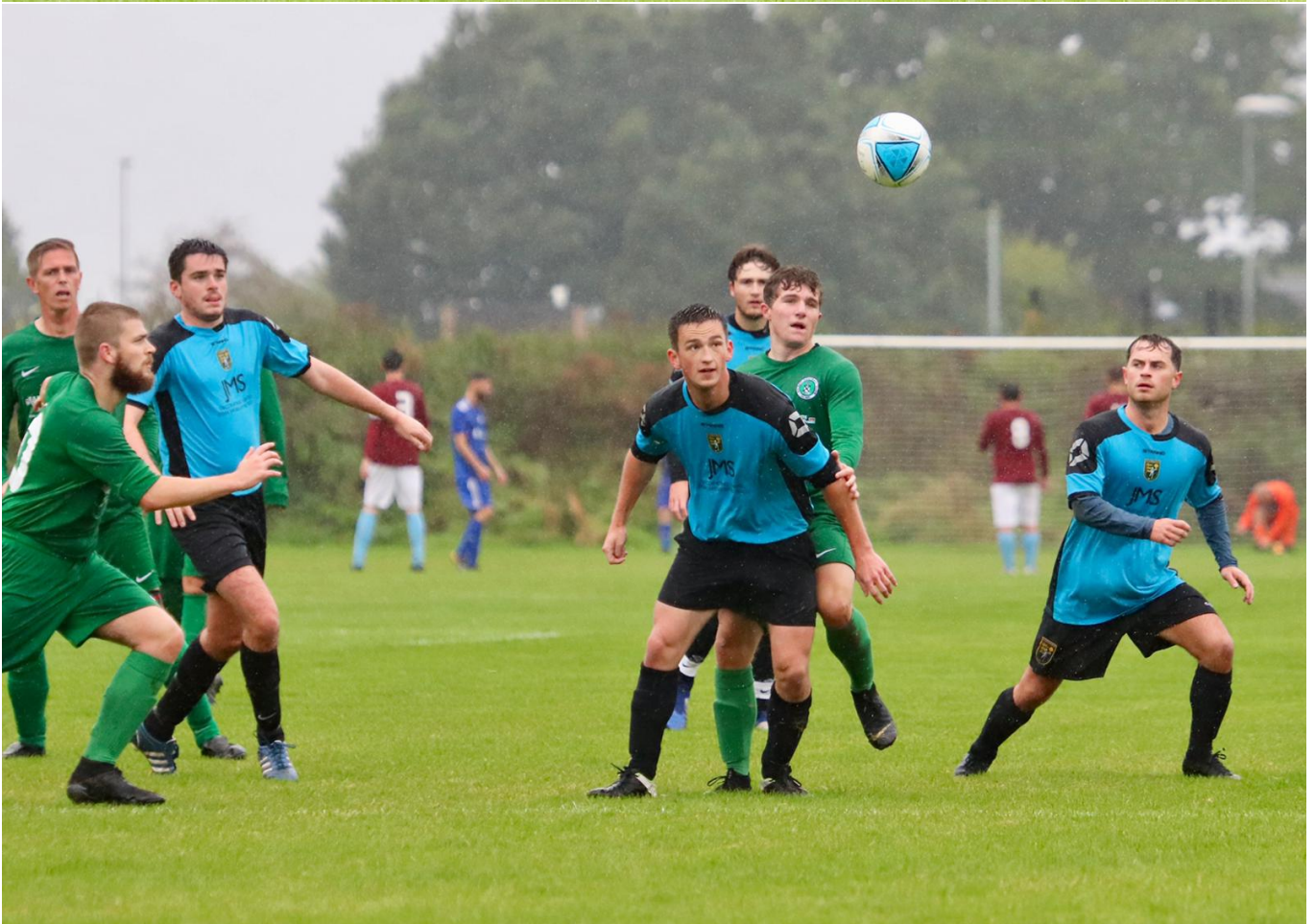
Photos from Helsby FC Res (Green) v Chester Nomads FC III (Blue)