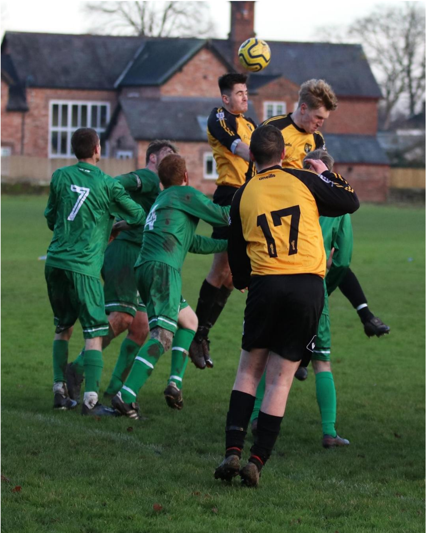
05/12/2020 Chester Nomads 3rds (gold) v Helsby Reserves (green)